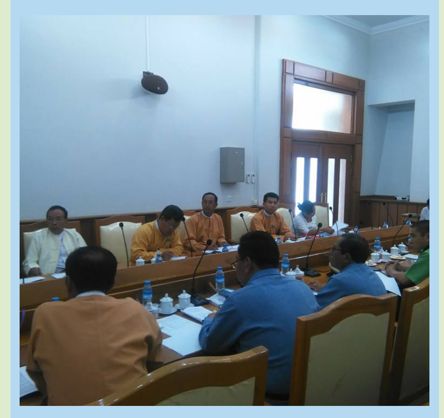
A meeting of "the Kachin State Municipal Law Amendment draft" was held on 5^{\rm th} May, and the State Hluttaw Bill Committee members and government department officials attended the meeting.