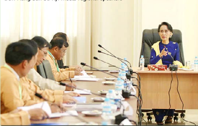
Daw Aung San Su Kyi meets regional speakers