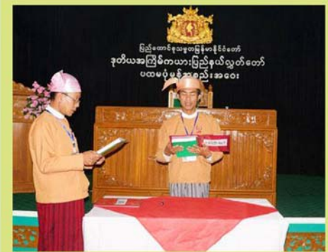
(Extracts from MOI Webportal Myanmar Facebook)

U Phyo Min Thein was appointed as the chief minister of Yangon Region Cabinet and he has taken an oath during the ninth day of the first session of the second regional Hluttaw. After the President has appointed U Phyo Min Thein as the chief minister of Yangon Region Cabinet, the Speaker of Parliament has announced U Phyo Min Thein as the chief minister and the Chief Minister has taken an oath during the Parliament session. (Extracts from Mizzima Burmese Website and Phyo Min Thein Facebook Page)