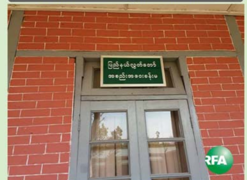
Door of Kayah State Parliament Meeting Hall